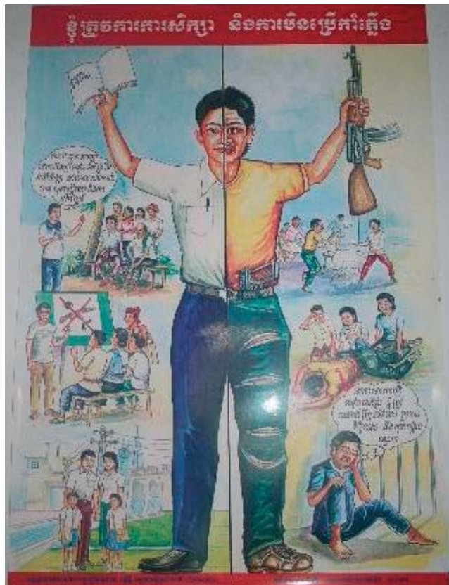
Picture 3: SALW Awareness poster, District Police station, Preah Vihear

During interviews with the villagers it quickly became clear that the overriding motivation for people to hand in their weapons during the weapons collection phases was a combination of respect for the law and a fear of punishment for illegal possession. 22 Moreover, traditionally in rural Cambodian society, firearms have never played a role in social, cultural or economic life, thus minimising any attachment to weapons owned rooted